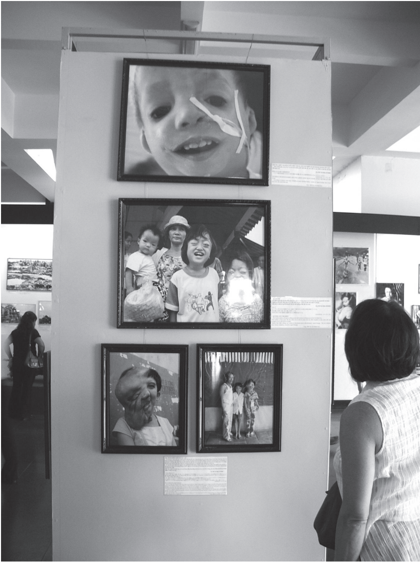
Figure 1 Agent Orange exhibit, War Remnants Museum, Ho Chi Minh City.