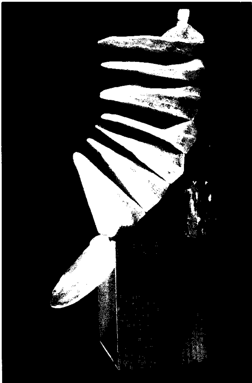
Kyle Hufman, Mask I , 1996. Wood, gauze, shellac, corn starch.