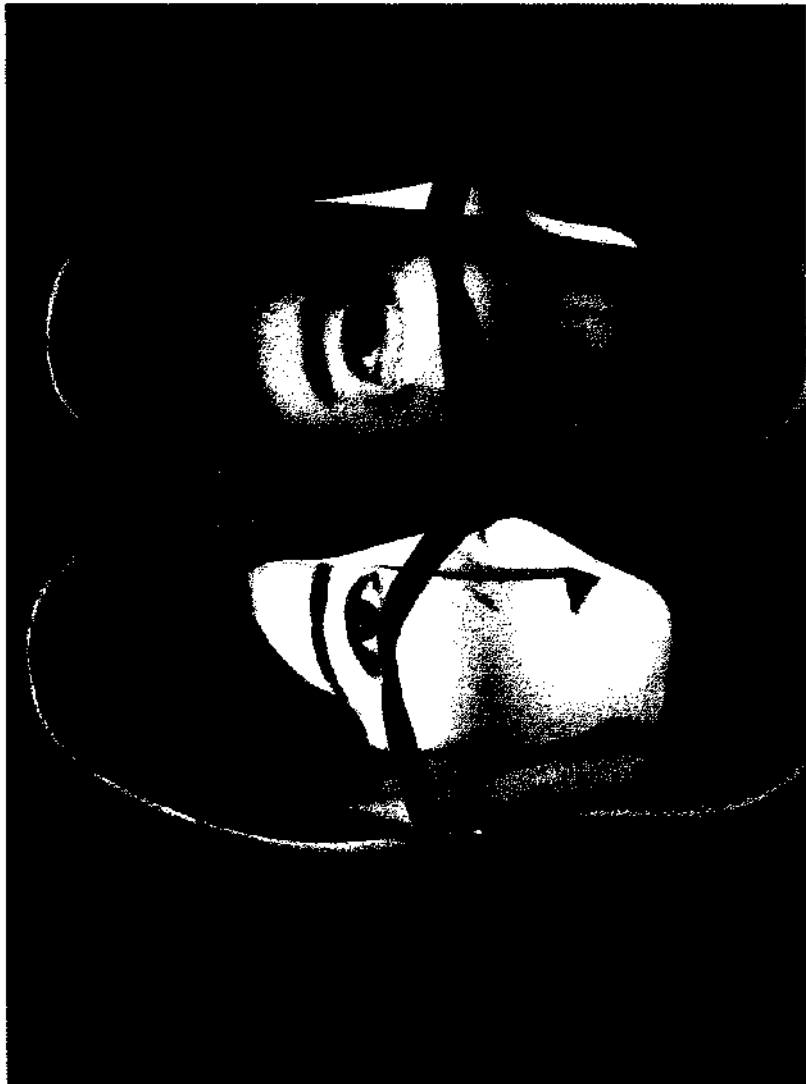
Yin Xiuzhen, Yin Xiuzhen , 1998. Mixed media.