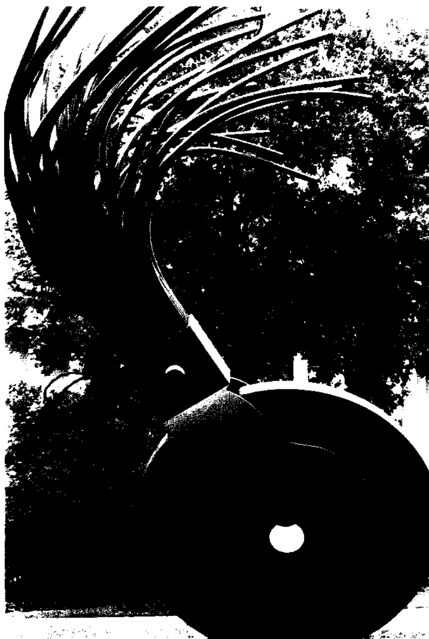
Claes Oldenburg, Typewriter Eraser , 1999. Washington, D.C.