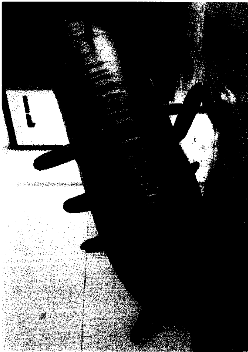
Irina Nakhova, Big Red , 1998. Installation, Galerie Eboran, Salzburg.