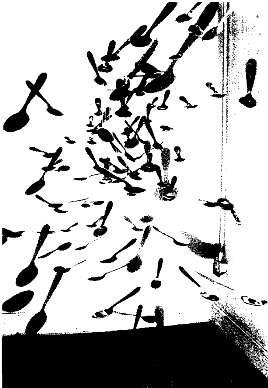
Graciela Sacco. From the series Bocanada . Instalación: 100 cucharas colgando , Basel, 2000. From Graciela Sacco (Buenos Aires, 2001).